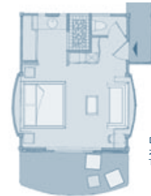
Bungalows : 27 sq.m Terrace : 8 sq.m